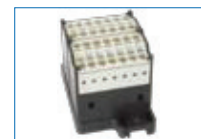
V33 Flush mounting socket art.no. 338 000 570

See page 50 for more sockets & accessories