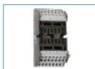
V29 Rail mounting socket art.no. 338 000 550