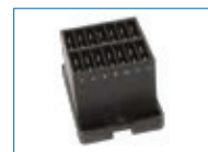
V31 Flush mounting socket art.no. 338 000 560